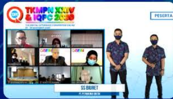
Virtual International Presentation Competition