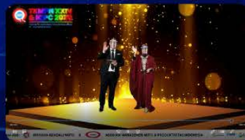
Virtual Closing Ceremony & Awarding