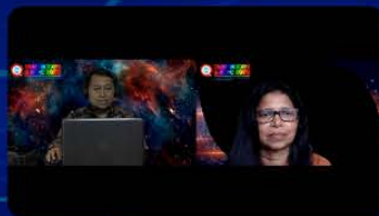
Virtual Best Practice Sharing Presentation