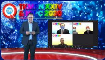
Virtual Opening Ceremony